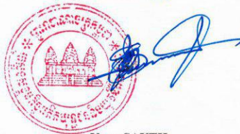
Vong SAUTH Minister of Social Affairs Veterans and Youth Rehabilitation